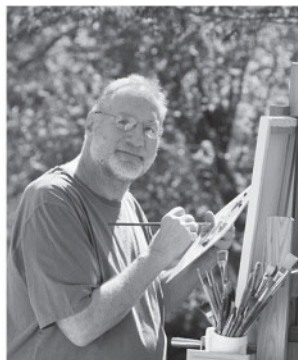
1 an artist

an artist an exhibition a painting a statue a theatre