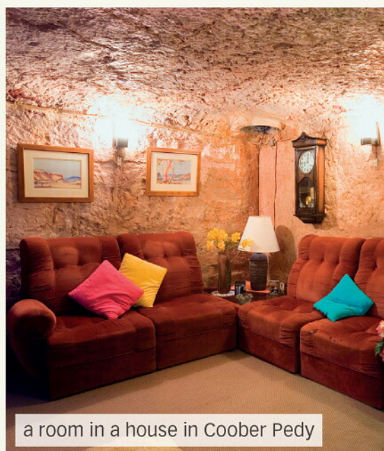
a room in a house in Coober Pedy