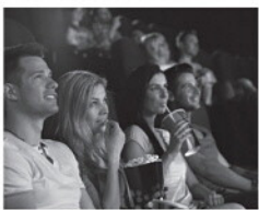
1 a cinema

an art gallery a cinema a classical music concert a dance lesson a film/movie an instrument a painting lesson a play a salsa class