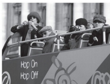
1 go on a tour

go on a tour go sightseeing go swimming meet local people stay in a hotel trek in the mountains visit a museum visit an art gallery