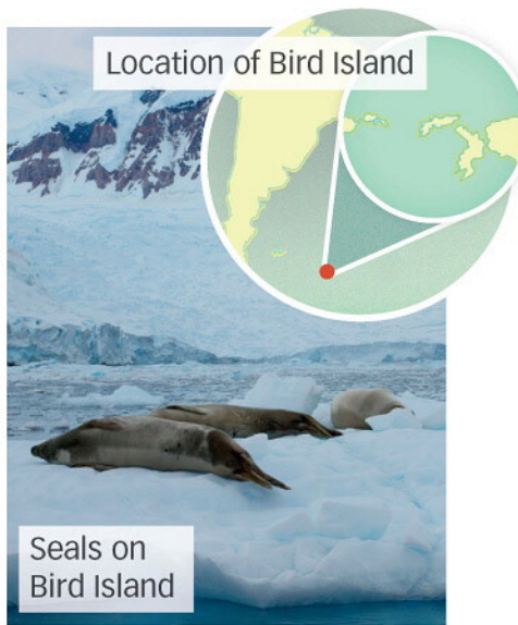
Seals on Bird Island

1 Work with a partner. Look at the photos and information about Bird Island and answer the questions.